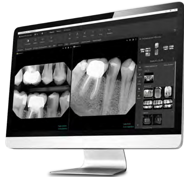
Image quality enhancements.

DEXIS IXS software and any associated updates can be automatically pushed to your computer. No downtime while you update. No need to manage discs or thumb drives. No calling tech support for help. Up-to-date and ready to go, always.