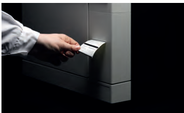
Print Set 2 Built-in adhesive label printer