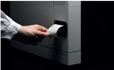
Print Set 1 Built-in thermal paper printer

Traceability is a hallmark of all Euronda Pro System autoclaves, the first to have an expandable traceability system. E8 is no exception to the rule. All sterilisation cycles are saved to an SD Card for transferral onto a computer. With E8, two different kinds of printers can be added according to your requirements, so you can save time without compromising safety standards.