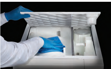
Tank compartment access system

The side panels are made of cutting-edge materials and they are extremely simple to remove. In addition, the components inside the machine are easily accessible and positioned in a logical manner. This helps to make maintenance easier, faster and more effective.